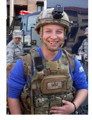
"It was a fun ROTC field trip! We saw some super cool careers & some super cool planes!"